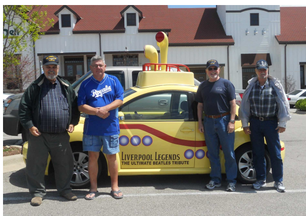
Yes, We Are Qualified!