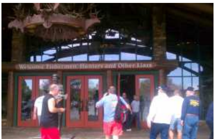
I think We Will Fit In