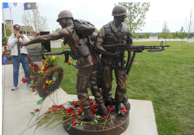
Missouri Vietnam Memorial on the campus of the University of the Ozarks