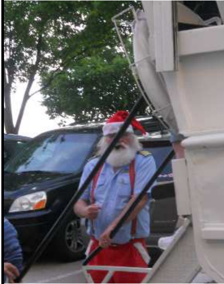
Santa Has A Part Time Job!