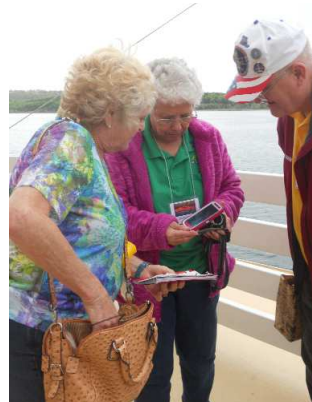
Oops! Wish My Grandson Was Here