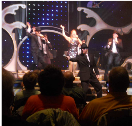
The Really Big Show!