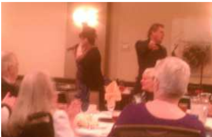
Before Dinner Entertainment