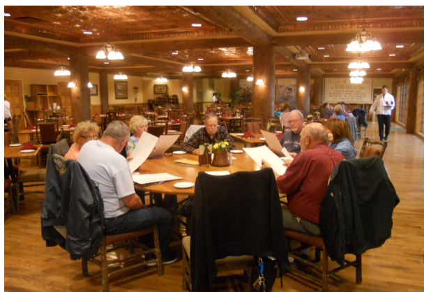
Lunch At "Hard Work U" (College of the Ozarks)