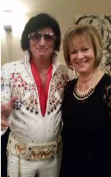
Elvis Was In The House!