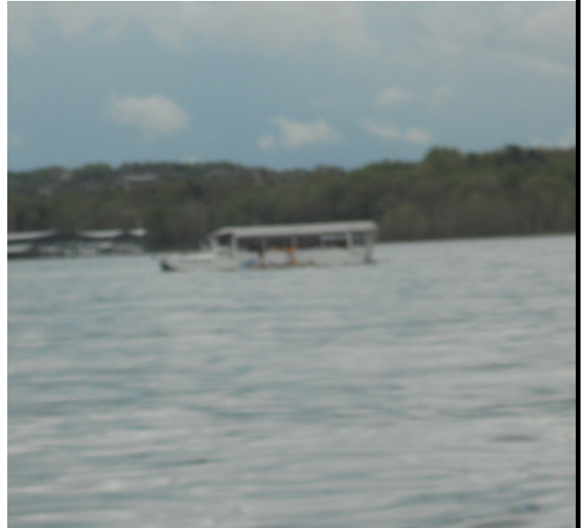
Yikes! I think they are sinking!