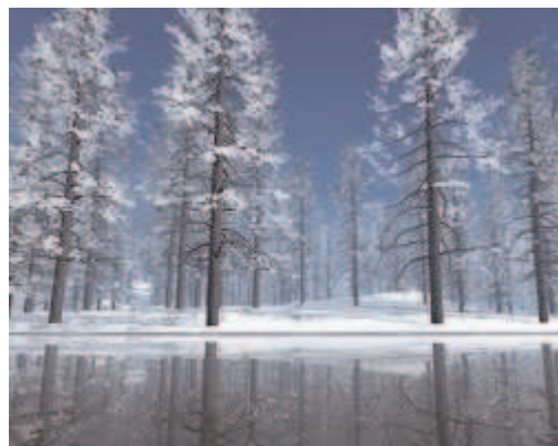
Target Rich Enviroment

Anyhow the fish continued at its best speed, skidded up the nearby beach and nailed a giant Washington state pine tree dead center! Upon receiving the boat back in the normal crew rotation. I personally verified this story by noting the entry in the weapons log book.